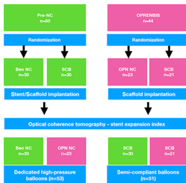
Figure 1 Study flow chart of the Pre-NC and OPRENBIS trials. NC, non-compliant; SCB, semi-compliant balloon.

For antithrombotic treatment, we ensured that all patients were pretreated with aspirin (eg, 100 mg daily dose prior to the procedure) and received clopidogrel 600 mg (in stable CAD) or ticagrelor 180 mg (or